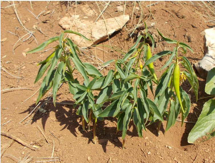
Fig. 1. Vincetoxicum mugodsharicum – Russia, Samara province, Pohvistnevo district, mountain Kopeika, 5 Jun 2014, photograph by A. V. Ivanova.

and P. prostratum have to be excluded from Polycarpon , while the remaining members represent a polyploid complex. Kool & al. (2007) also suggested to treat all the members of the P. tetraphyllum (L.) L. group as a single species with several infraspecific taxa. Accordingly, new nomenclatural combinations were proposed also considering morphological, ecological, and chorological data (see, e.g., Iamonico 2013, 2015; Iamonico & Domina 2015).