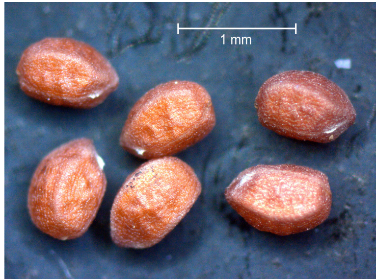
Fig. 2. Euphorbia hypericifolia – seeds. – Photograph by K. Sutorý.

N. M. G. Ardenghi, P. Cauzzi & G. Galasso