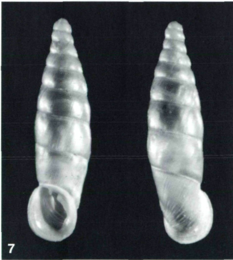
Figs 5-7: (5) Montenegroina helvola ornata ERÖSS & SZEKERES ssp.n., holotype NHMB 70838, 15.7 \times 3.3 mm; (6) Montenegroina irmengardis welterschultesi FEHÉR & SZEKERES ssp.n., holotype NHMB 70840, 22.1 \times 4.8 mm; (7) Isabellaria riedeli distanta SZEKERES ssp.n., holotype NHMB 70842, 15.6 \times 3.9 mm.

Description: The brownish horn-coloured shell of 9 to 9\frac{1}{3} whorls is almost entirely smooth, with fine ribs appearing over the apex. The aperture is relatively large, rounded, the peristome is gradually widening. From behind the peristome to the dorsal region the neck is covered by coarse, evenly spaced ribs. The basal crest is well developed, it lends an angular contour to the last whorl when seen from the front. The lamella superior is short, slightly S-shaped. The lamella inferior is positioned high in the aperture, in a perpendicular view it stands well apart from the lamella superior and the mostly hidden subcolumellaris. The lunella is lateral to ventrolateral. The dimensions of the shells are 15.5\text{-}16.3 \times 3.7\text{-}3.9 mm.